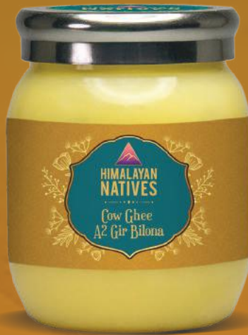
A2 Gir Cow Bilona Ghee