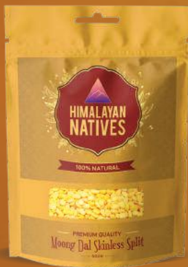
Moong Dal Skinless Split