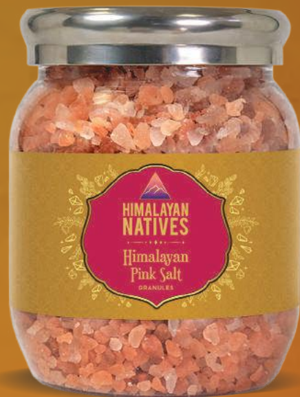
Himalayan Pink Salt Granules