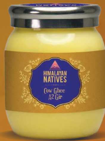
A2 Gir Cow Ghee