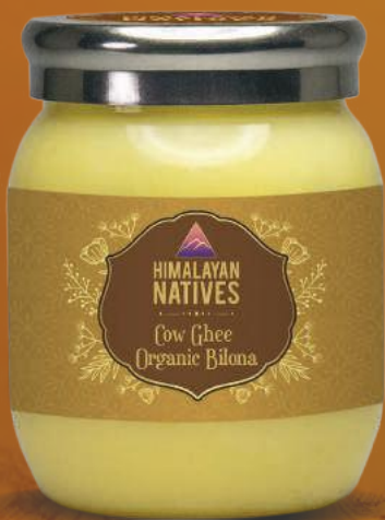
Organic Bilona Cow Ghee