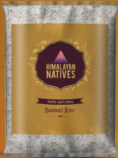
Premium Basmati Rice

Naturally Harvested | Preservative-free | pesticide-free