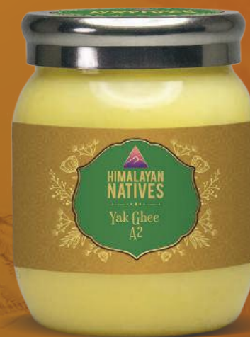
A2 Yak Ghee