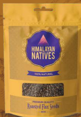
Roasted Flax Seeds