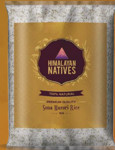
Premium Sona Masuri White Rice