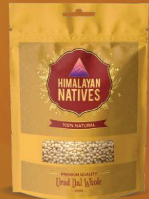
Urad Dal Whole