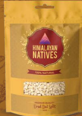
Urad Dal Split