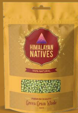
Green Gram Whole