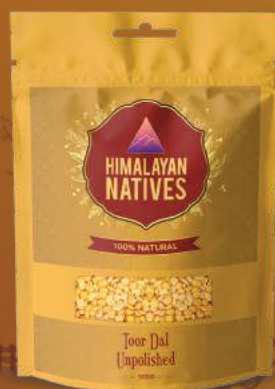
Toor Dal Unpolished