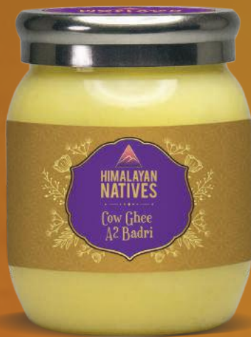
A2 Badri Cow Ghee

Traditional method | Authentic aroma & flavour Granular texture | Preservative-free