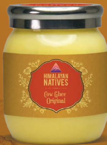
Original Cow Ghee