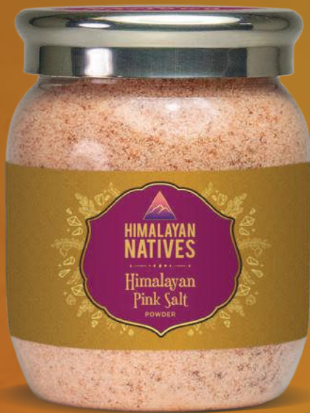
Himalayan Pink Salt Powder

Naturally-harvested | Mineral-rich Unrefined