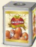
Gulab Jamun Available in : 17 kg