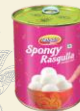
Spongy Rasgulla Available in : 1Kg | 500g