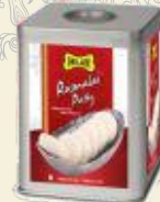
Rasmalai Patty Available in : 17 kg