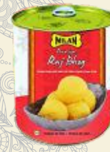
Raj Bhog Available in : 3.6kg | 1kg