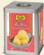
Raj Bhog Available in : 17 kg