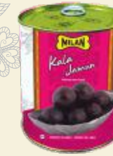
Kala Jamun Available in : 3.7kg | 1kg