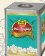
Mini Rasgulla Available in : 17 kg