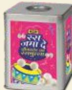
Ras Jama De Rasgulla Available in : 17 kg