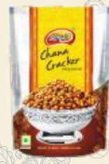
Chana Cracker Available in : 400g | 200g