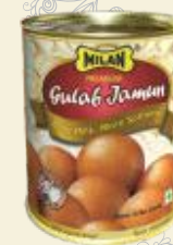
Gulab Jamun Available in : 3.6kg | 1Kg | 500g | 250g