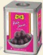
Kala Jamun Available in : 17 kg