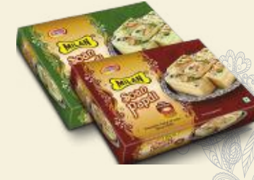
Soan Papdi Available in : 1kg | 800g | 500g | 400g | 200g