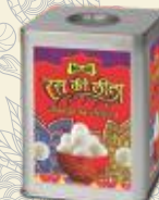
Ras Ki leela Rasgulla Available in : 17 kg