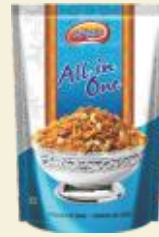
All in One Available in : 400g | 200g