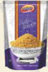
Raita Boondi Available in : 400g | 200g