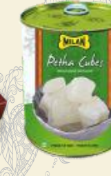
Petha Cubes Available in : 3.7kg | 1kg