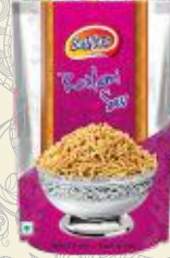
Rattami Sev Available in : 400g | 200g