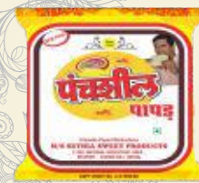
Panchsheel Papad Available in : 400g | 200g