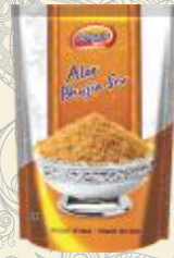
Aloo Bhujia Sev Available in : 400g | 200g