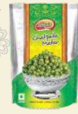
Chatpata Matar Available in : 400g | 200g