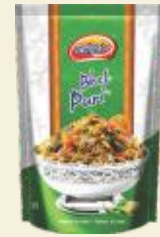
Bhel Puri Available in : 400g | 200g