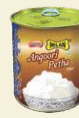
Angoori Petha ( Plain ) Available in : 3.6 kg | 1kg | 500g