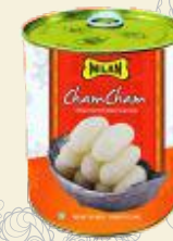
Chamcham Available in : 3.7kg | 1kg