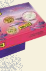
Milan Unlimited Maaza