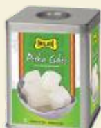
Petha Cubes Available in : 17 kg