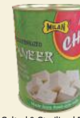
Salted & Sterilized Paneer Available in : 825g | 450g | 200g