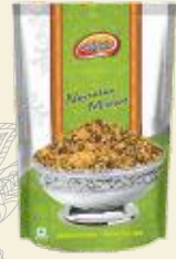
Navratan Mixture Available in : 400g | 200g