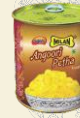
Angoori Petha (Kesar) Available in : 3.6 kg | 1kg | 500g