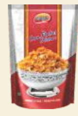
Corn Flakes Mixture Available in : 400g | 200g