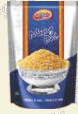
Moong Dal Available in : 400g | 150g