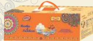
Meetha & Namkeen