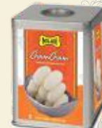
ChamCham Available in : 17 kg