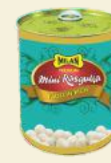
Mini Rasgulla Available in : 3.6kg | 1Kg