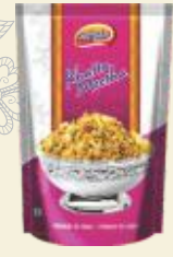
Khatta Meetha Available in : 400g | 200g