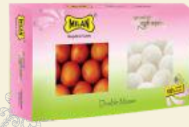
Milan Double Maaza