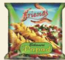
Bikaneri Papad Available in : 1 Kg | 400g | 200g