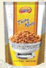
Tasty Nuts Available in : 400g | 200g