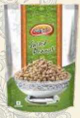
Salted Peanut Available in : 400g | 200g