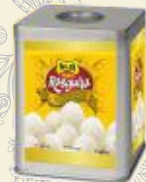
Rasgulla Available in : 17 kg