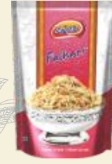
Falahari Available in : 150g