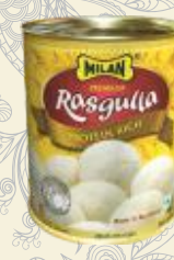
Rasgulla Available in : 3.6kg | 1Kg | 500g | 250g