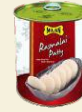
Rasmalai Patty Available in : 3.7kg | 1kg